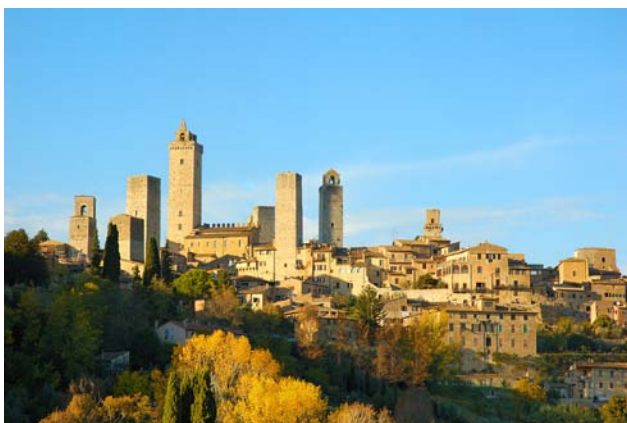
San Gimignano