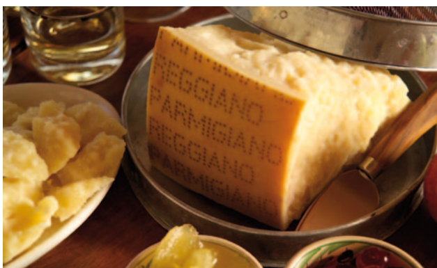
Parmigiano Reggiano – Italian Cheese