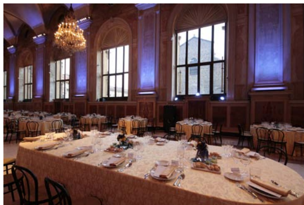
Palazzo Re Enzo