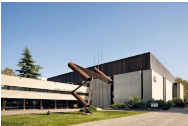
Palazzo dei Congressi