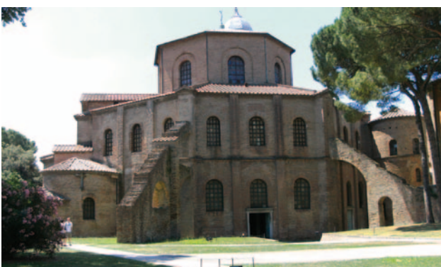
Ravenna: Basilica San Vitale

Departure from Bologna and arrival after 1,5 hour. Meeting with the English speaking guide and visit of the magnificent Byzantine mosaics for which Ravenna gained the award as UNESCO heritage. You will see Basilicadi San Vitale, Galla Placidia, Battistero Neoniano and S. Apollinare Nuovo.