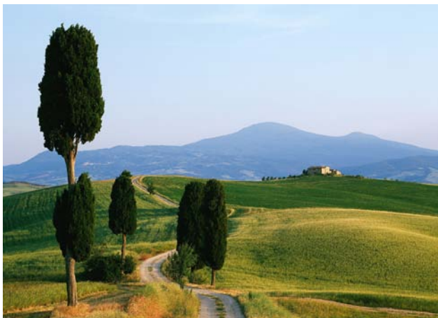
Tuscan Landscape

Early in the morning, pick up from your hotel in Bologna with your private bus and assistant. Departure to San Gimignano, arrival in this tiny city that has remained intact through the centuries, beautiful town, UNESCO world heritage, where you'll be given free time to visit the medieval town centre planning with the numerous and beautiful towers hence the name "Manhattan of the Middle Ages". Arrival in Siena and light lunch in a centre located restaurant. Siena guided visit in the afternoon for maximum 3 hours with English speaking guide. Your guide will bring you on a private tour of the old city centre: walking along the small medieval streets, admiring the splendid palaces and ending up at the Cathedral where you can visit the splendid interior including the Libreria Piccolomini. The guided tour will conclude in the Piazza del Campo, one of the most beautiful in the world, where you will find the Palazzo del Comune (exterior). Free time for your dinner (not included) and overnight in your 4* hotel centrally located.