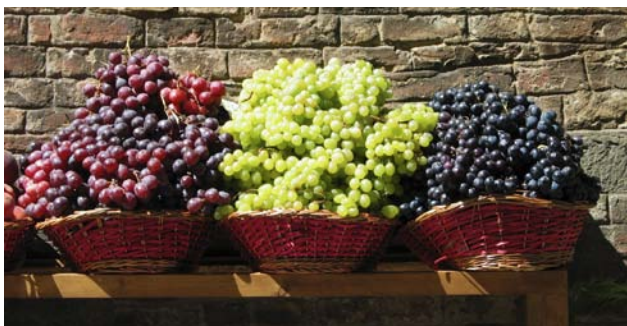
Italian Wine

Early in the morning, pick up from your hotel in Bologna with your private bus and assistant. Enter the heart of real Tuscany with medieval villages of incomparable charm, an ancient farming tradition that produces wine, cheese, cold cuts and excellent meat renowned and appreciated all over the world even today. The beauty of the landscape declines harmoniously where nature and the works of man have lived together for centuries in an unbeatable balance. Through the hilly expanses of the old vineyards and olive groves, which characterise the splendid Chianti territory we reach Greve where we you will enjoy the charm of its historic square flanked by open galleries and wander around the characteristic shops of local handicrafts and the typical Chianti products. Visit, lunch and tasting in a beautiful ancient castle. Then you will visit Castellina in Chianti, a characteristic ancient hamlet set on a hill and nestled between stretches of vineyards and olive groves and San Donato in Poggio, an ancient settlement in a fortified castle dating back to the eleventh century, which maintains part of its walls and a stunning Romanesque parish church. Dinner and overnight in 4* Villa in Tavarnelle Val di Pesa.