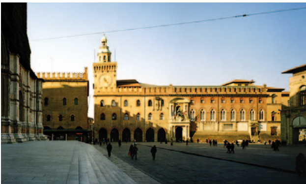
Bologna: Palazzo Comunale

Guided walking tour of Bologna historical centre. Starting from the heart of the town Piazza Maggiore, you will visit the major buildings such as Palazzo d' Accursio, Palazzo Re Enzo, Palazzo del Podestà, San Petronio, Fontana del Nettuno, Palazzo dei Notai and the magnificent Palazzo de' Banchi. Besides you will visit the Archiginnasio and the Teatro Anatomico, the two towers and Santo Stefano complex of 7 churches.