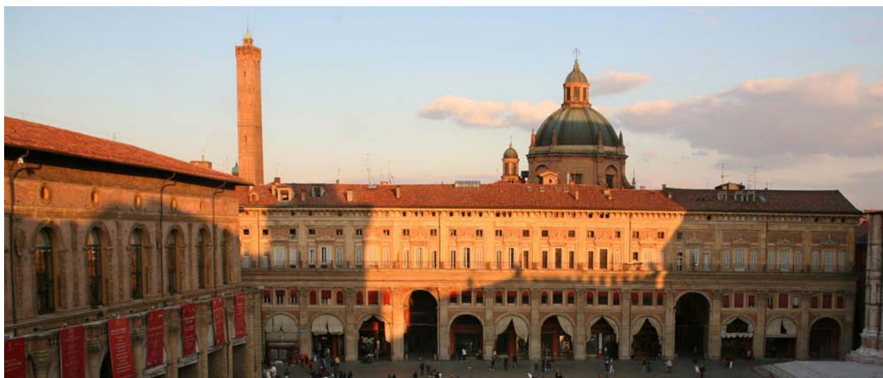
Comune di Bologna – Piazza Maggiore